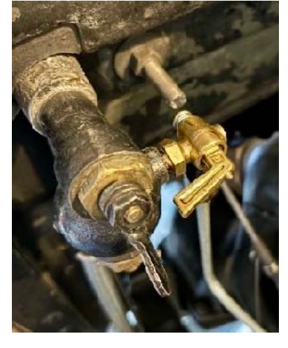
Above Left: Fuel shut-off valveValve on Don's T.

If you're replacing the fuel shut off valve, do it while your gas tank is mostly empty. I started the